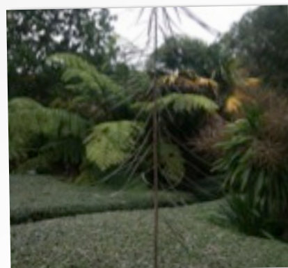
NATIVE TREE TO NEW ZEALAND