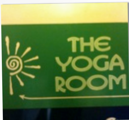
THE YOGA ROOM GISBORNE, NEW ZEALAND